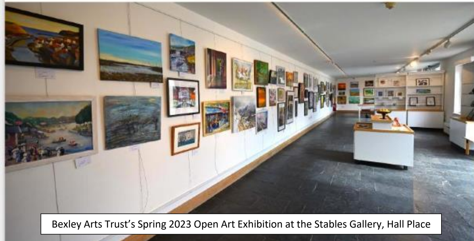
Bexley Arts Trust's Spring 2023 Open Art Exhibition at the Stables Gallery, Hall Place

Further information on how to submit your work to follow in our next Newsletter and will be emailed to members. So watch this space!