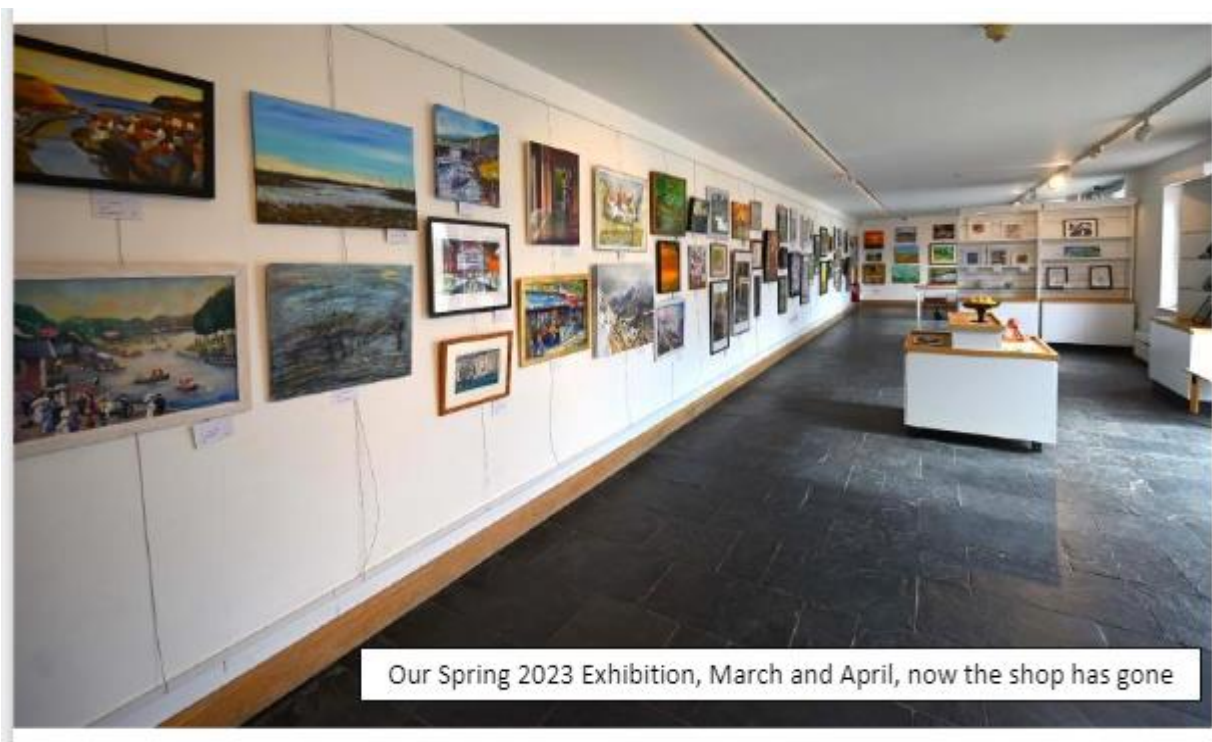
Our Spring 2023 Exhibition, March and April, now the shop has gone

Get creating! .... The dates for our next Open Exhibition will be released soon. Painting, drawing, printing, mixed media and 3D submissions are welcomed. Further information to follow in our next Newsletter and will be emailed to members. So watch this space!