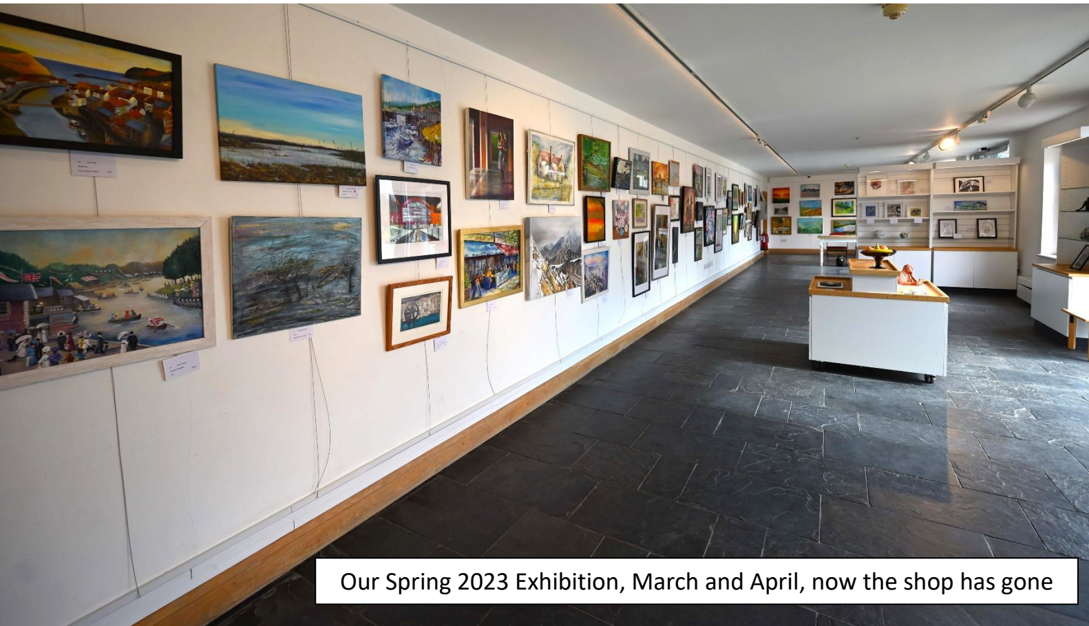
Our Spring 2023 Exhibition, March and April, now the shop has gone