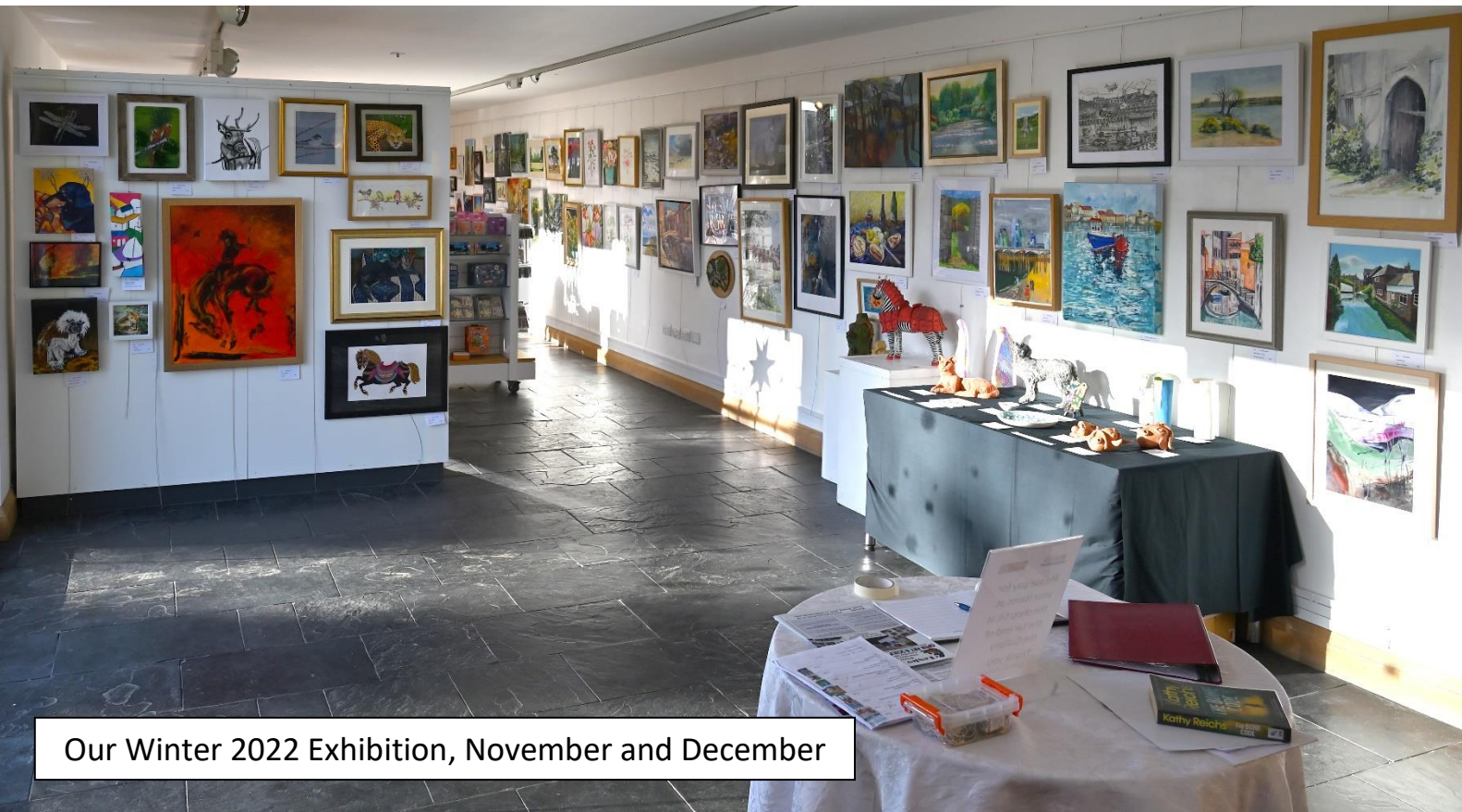
Our Winter 2022 Exhibition, November and December